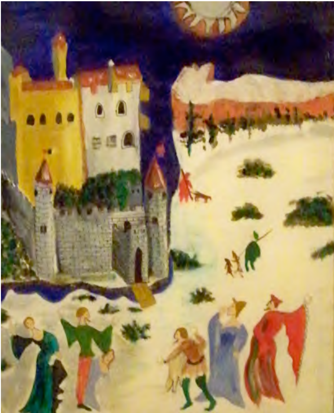
Winter Morning - based on a 13th century French painting

Picture by Mike Pozar of Illiton. Used with Permission